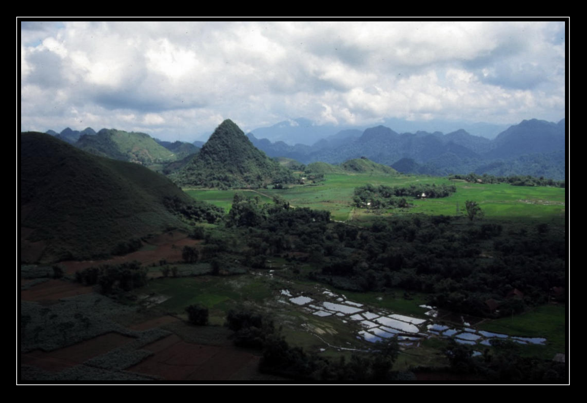
• Welcome to Vietnam, where people finally found peace in their cultural and natural heritage. © Greenish hilly rice and forest country near Moc Chau, towards the border of Laos (around 150 km east of Hanoi) – August 2003