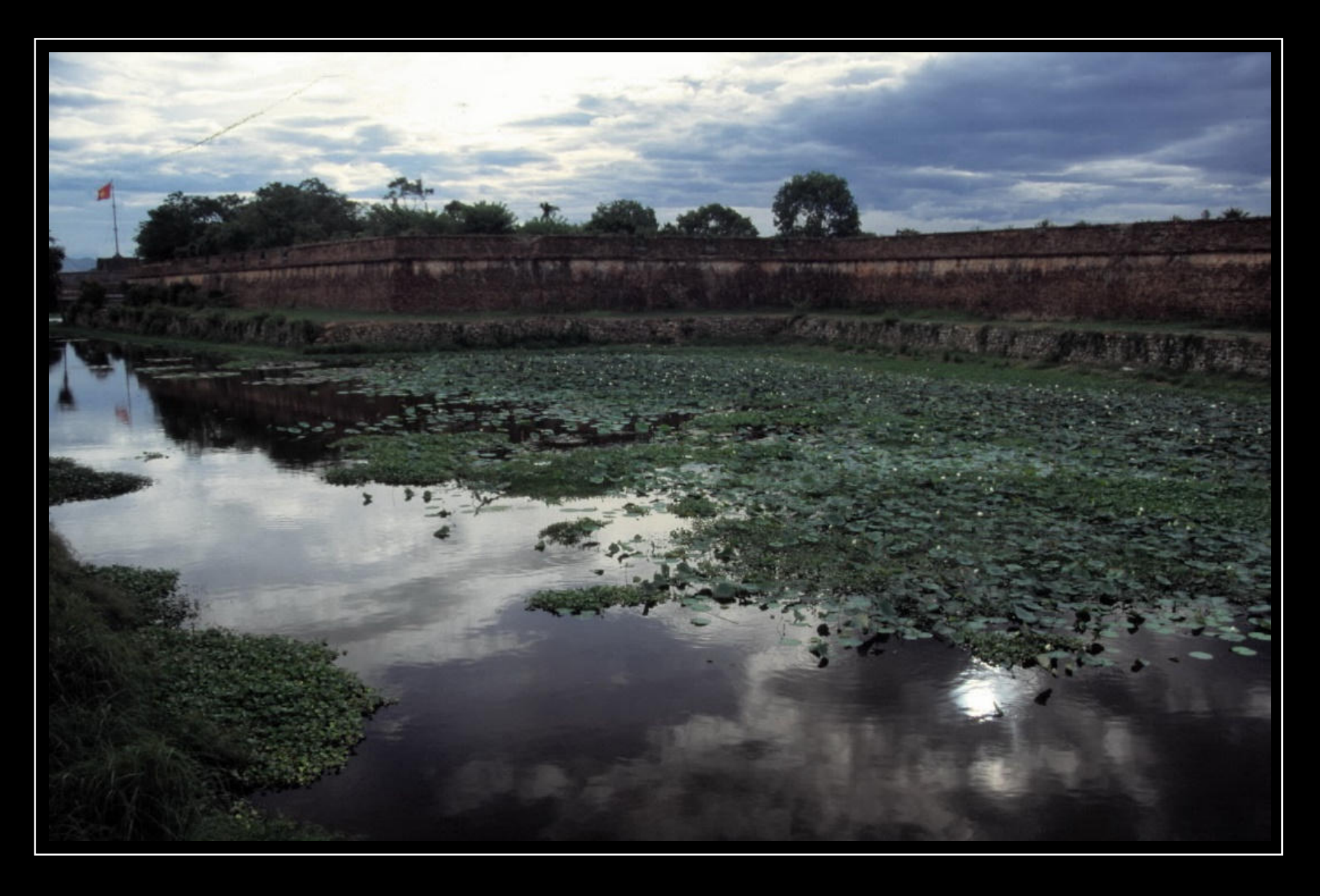
Float also in the coming year like a cloud over the reflecting ditches of your soul! © Bonus-Pic: Citadel (Kinh Thanh) with vivid walls and moat along the gates of the Emperor town Hue (Central Vietnam) - August 2003