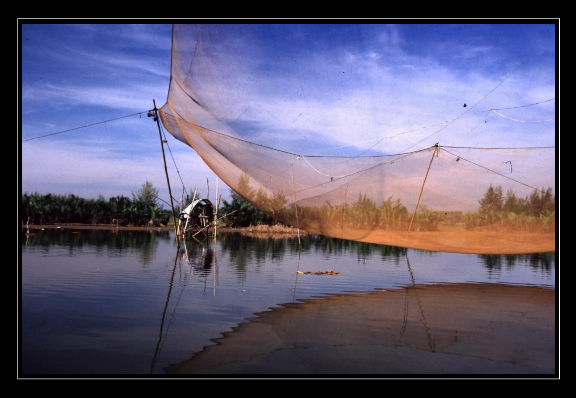
• Have faith in your intuition, which net will wriggle you and which will pick you up! © Impressive construction of fishing during a boat trip on the Thu Bon river near Hoi An (Central Vietnam) – August 2003