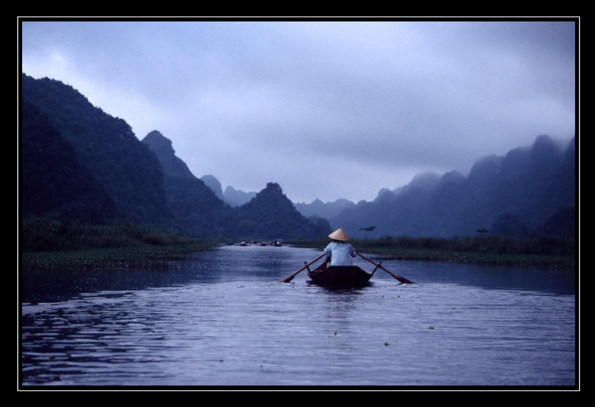
Slide with a powerful row – regular and easy – on your paths to the mysterious unknown! © Via boat to the perfume pagoda (Chua Huong) in the limestone mountains of Huong Tich (60 km south-west of Hanoi) – August 2003