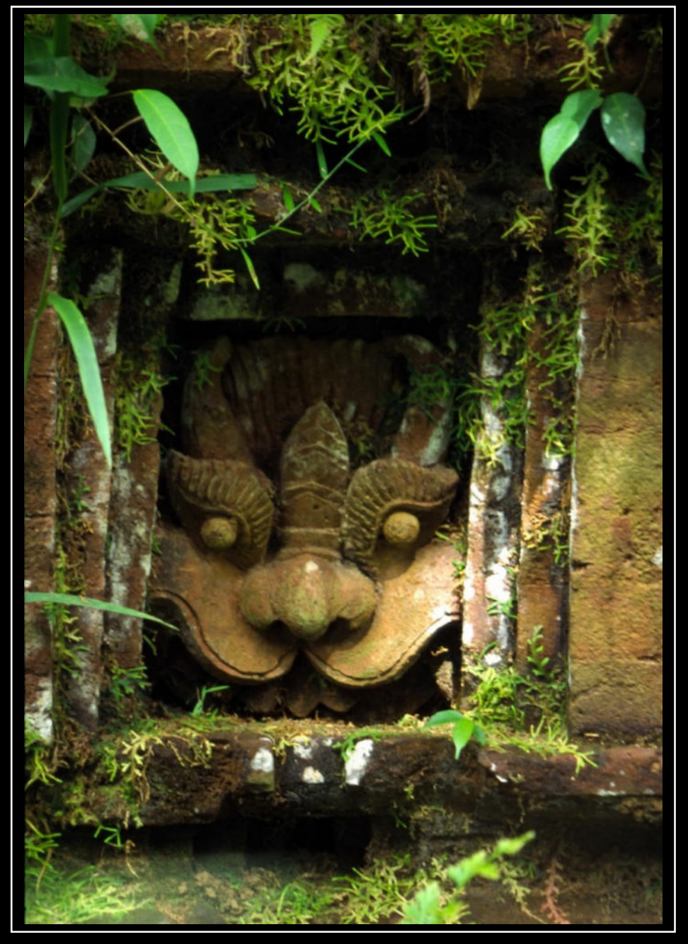
• Don't fear the daemons of our time. They are instructive parts of our dark sides! © Plants twining around a "bodyguard"-sculpture in the ruins of My Son (religious place of the Cham culture) – August 2003