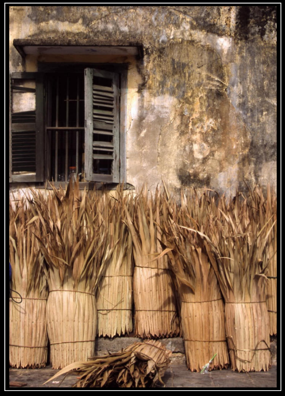
© Be different! Only those who fall over and step out once a while can stand up proudly again! © Typical street scene with terrace front in the old town center at the harbor of Hoi An − August 2003