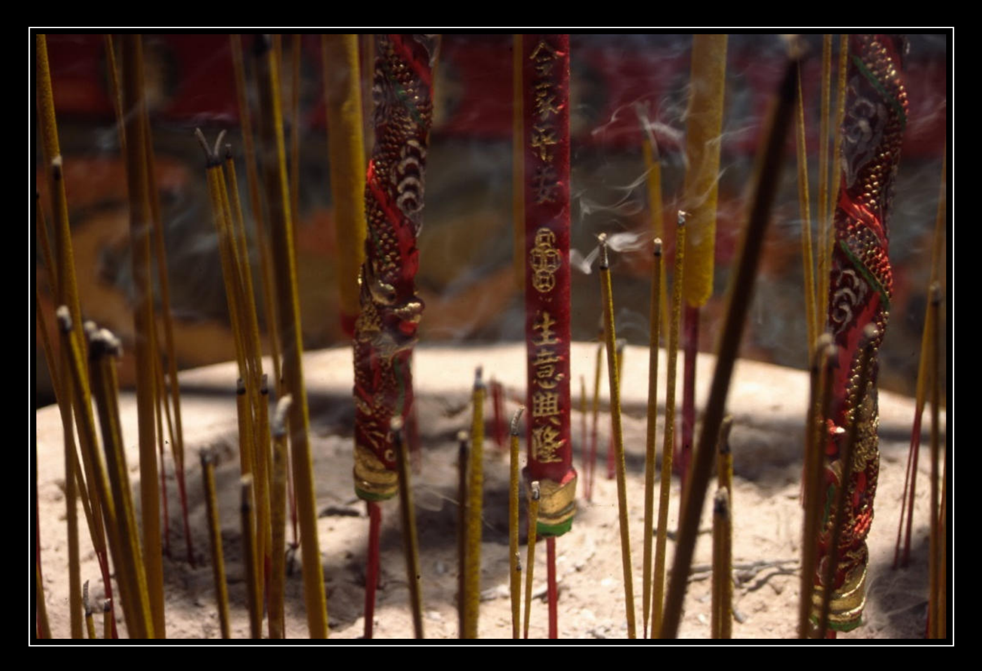
● Enjoy the scent of joss sticks. They seduce you into the world of senses and thoughts! ⑤ Atmospheric detail in the Quan Am Pagoda (religious place) in the Cholon District of Ho-Chi-Minh-City (Saigon) – August 2003