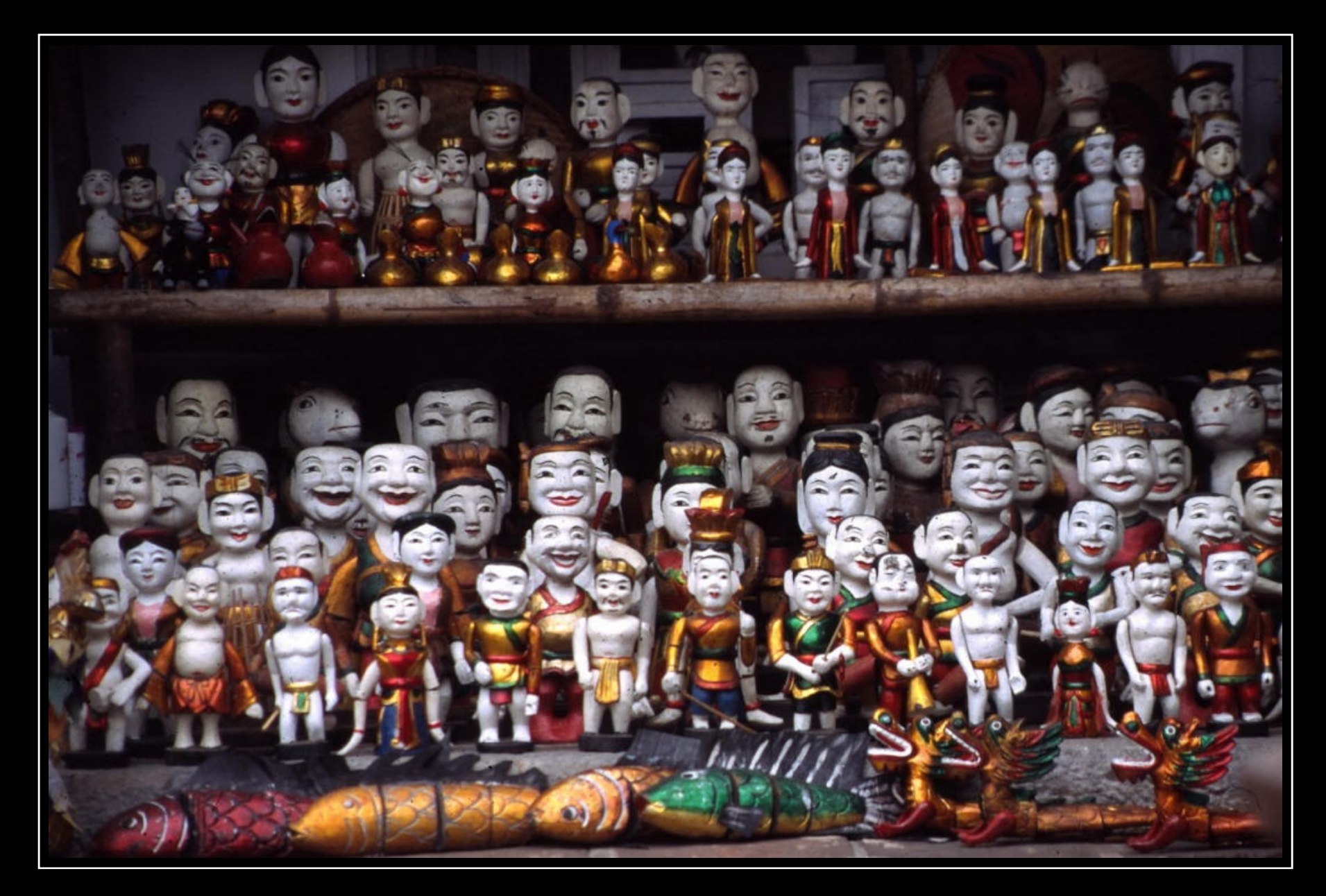
Meet familiar as well as unknown faces with a curious, respectful smile! ☺

Figures of the famous water-puppet-play parading as souvenirs in the Temple of Literature (Van Mieu) of Hanoi – August 2003