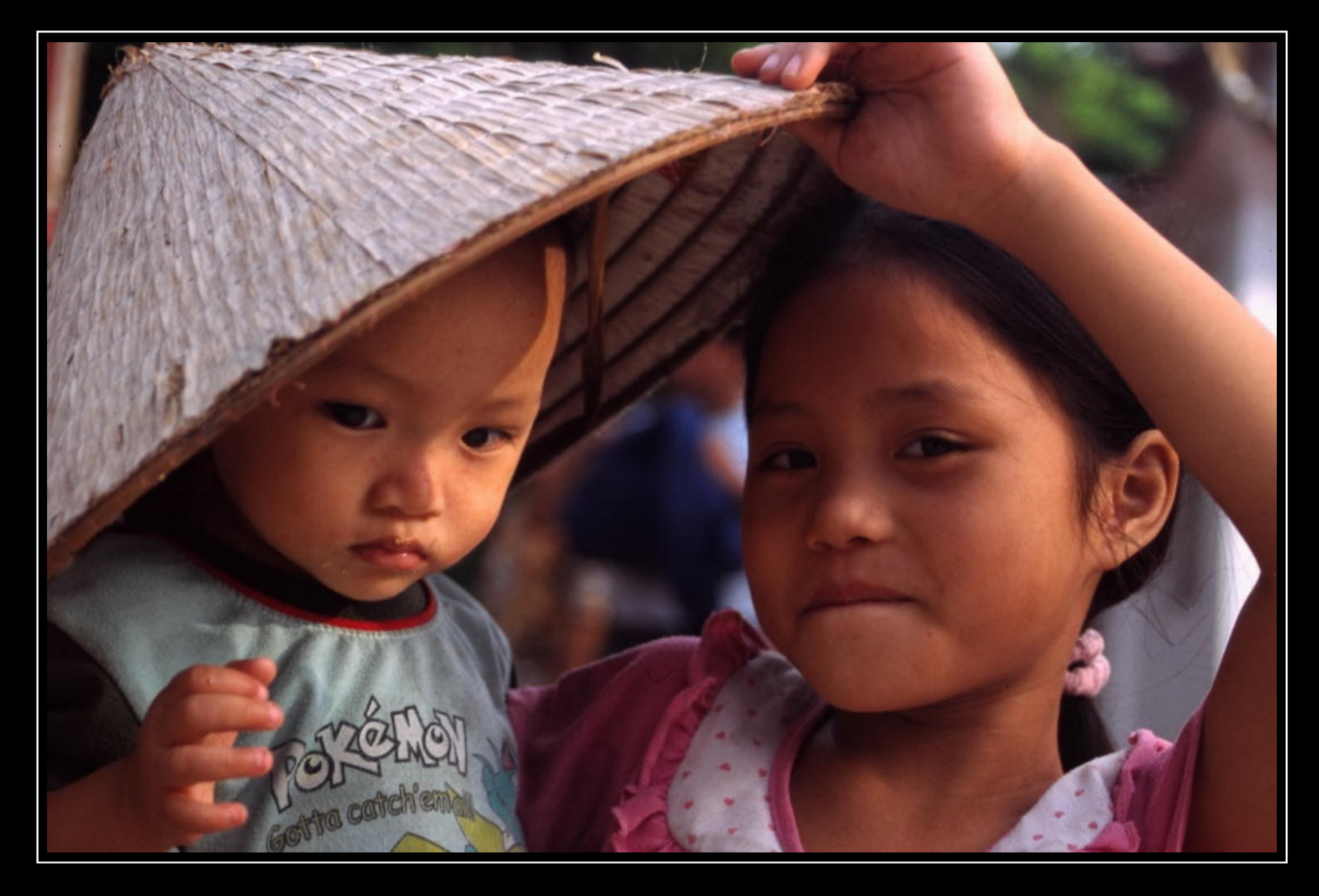
© Take off your curiosity-hat now and again to greet the world! There is so much to discover! ☺ Cheerful siblings at the mooring of My Duc (ca. 60 km south-west of Hanoi) – August 2003