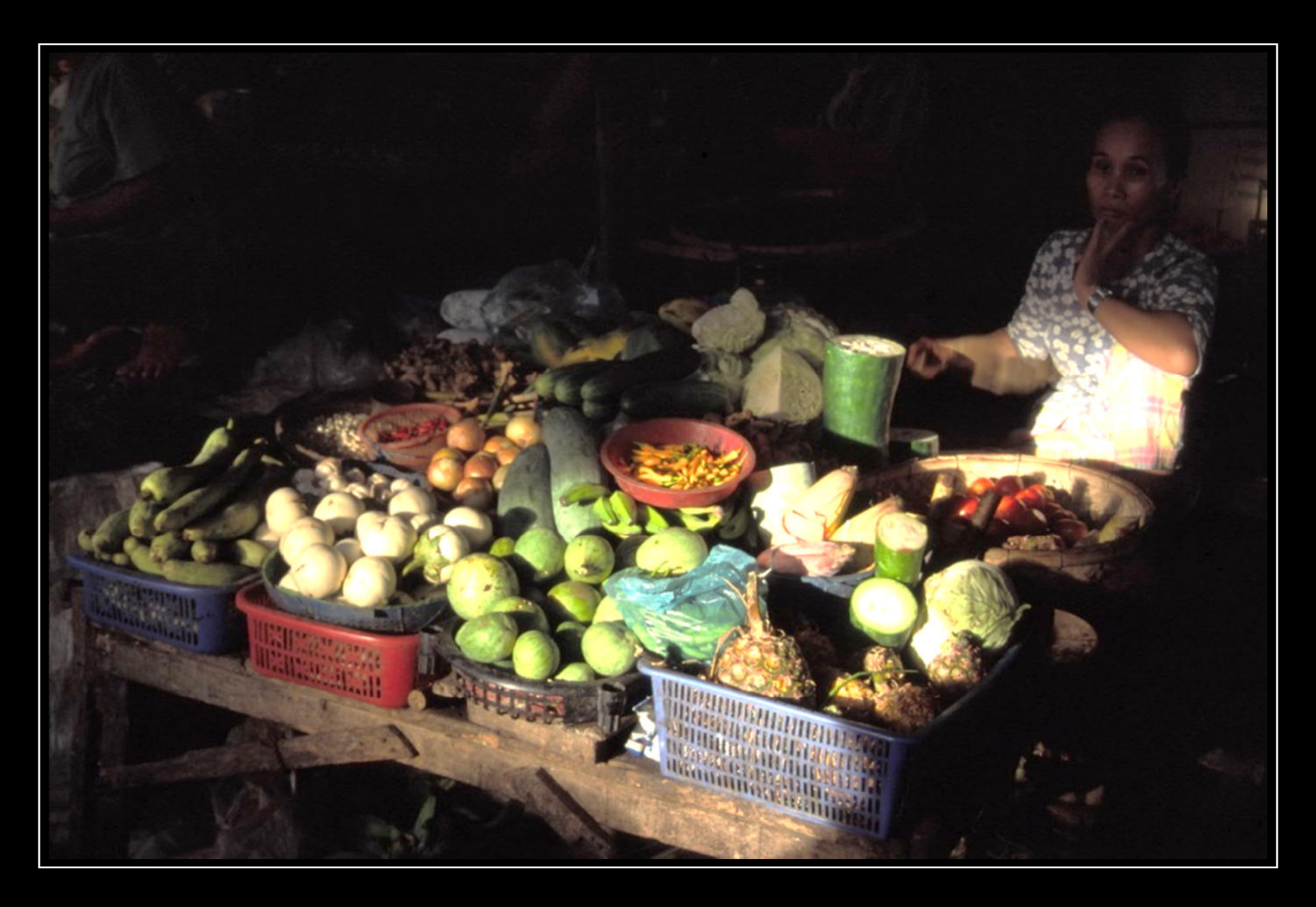
■ Take the world's treasures not for granted. Many things still remain a secret! © Fruits and vegetables being aglow in the sunlight at the market of Hoi An (coastal town in Central Vietnam) – August 2003